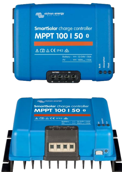
SmartSolar Charge Controller MPPT 100/50